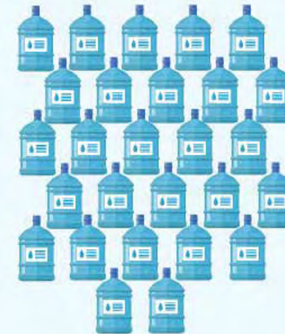
In a typical a/c system, about 27 gallons of water go down the drain every day!

We can stop this from happening. When we do annual service on your a/c system, we'll clean the coil and flush the condensation line to prevent dirt buildup in your system. We can also install a float switch, which will automatically shut down your system if a drainage problem occurs.